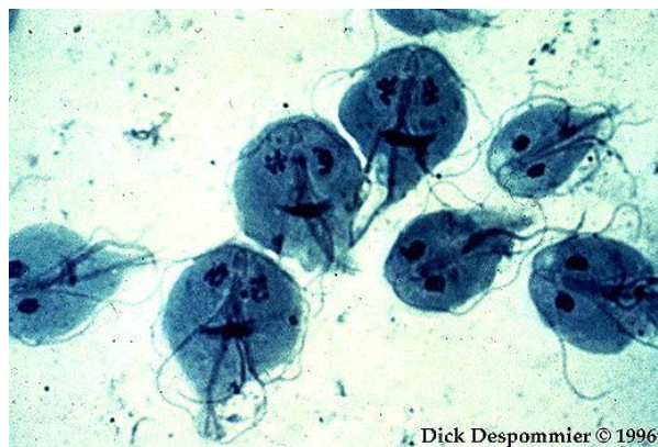
Figure 1. Giardia lamblia in Gram staining

The protozoan Giardia lamblia (Figure 1) is the most frequently isolated intestinal protozoan parasite around the world and it is the causal agent of the disease known as giardiasis [10]. Giardia lamblia is a unicellular, flagellated intestinal protozoan parasite isolated worldwide and is ranked among the top 10 human parasites [11, 12]. The morphology of Giardia is encountered in two forms: trophozoite and cyst. The trophozoite stage is approximately 12-15 microns by 6-8 microns [13]. The cyst of Giardia lamblia is elliptically shaped, range in size from 6 to 10 microns and contains two to four nuclei [14].