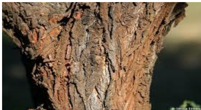
Figure 2. Acacia. nilotica (bark)

Abdelgadir from Medicinal and Aromatic Plants and Traditional Medicine Research Institute (MAPTMRI) in Khartoum, Sudan. Bark of A. nilotica (Figure 2) was air-dried, under the shade, pulverized and stored prior to extraction. Shade with good ventilation and then ground finely in a mill and kept in the herbarium until extract preparation.