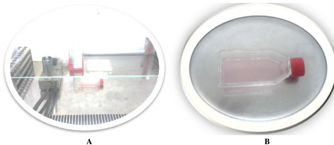
Figure 3. Culture of G. lamblia in RPMI 1640 medium. A: Laboratory hood B: Culture flask containing medium and protozoan

Giardia lamblia used in the experiments were taken from patient with positive giardiasis from Ibrahim Malik Hospital (Khartoum). Samples were transported from the hospital to the laboratory of research institute in RPMI 1640 medium. Culturing of the G. lamblia trophozoites was performed at 37 \pm 1^\circ\text{C} in RPMI 1640 medium supplemented with 5% fetal bovine serum (FBS). The cultured trophozoites were used for the assay in the log phase of growth (Figure 3).